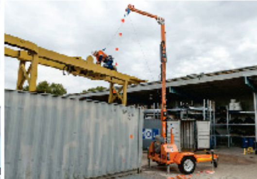
AIR HOOK TRAILER