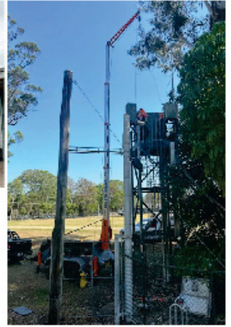
ANCHOR POINT BLOCK