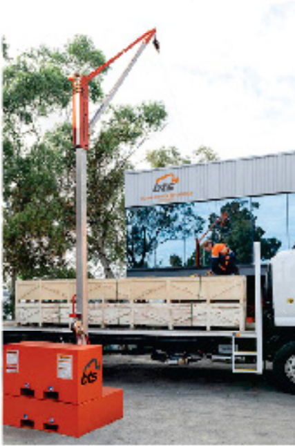
AIR HOOK LITE